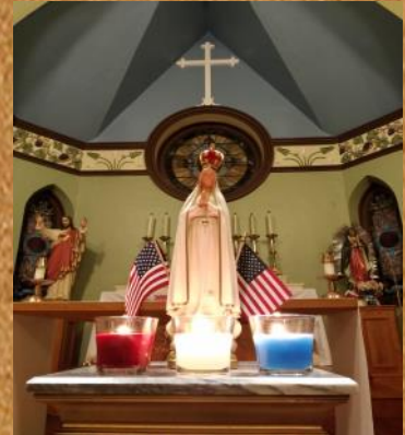
Patriotic Rosary 20 Feb 2018 Chapel, St. Stephen Catholic Church,